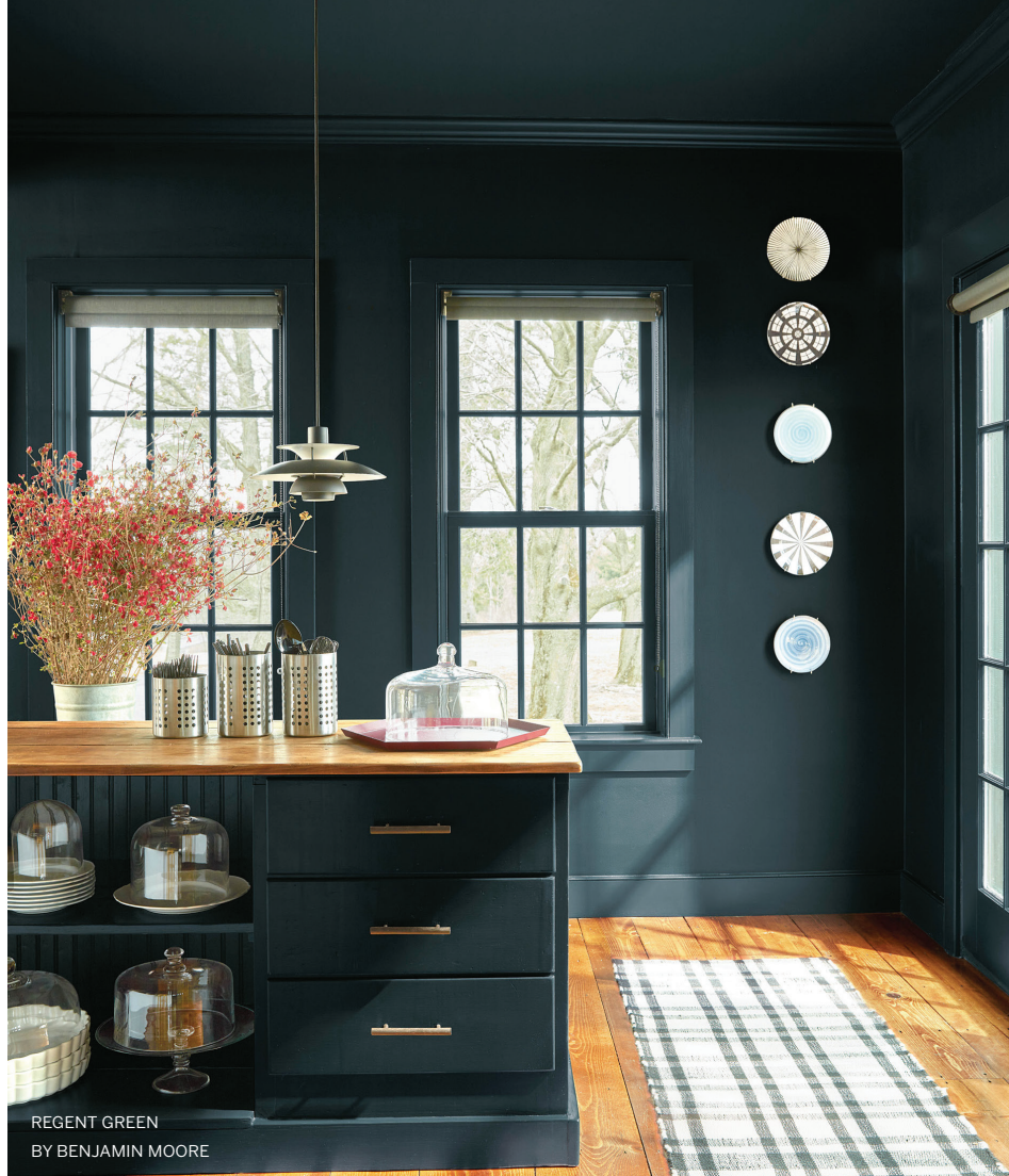
REGENT GREEN BY BENJAMIN MOORE

When incorporating color in home design, one of the most important considerations is balance. Haukaas notes "powder rooms and entryways are great spaces where people like to be bold. You can have fun without committing to a big space, and you don't have to consider furnishings or [other] home accessories." Haggerty agrees, saying, "Dramatic colors need to be done in small, intentional doses, [such as] a powder room, focal point wall in a loft, or a child's playroom."